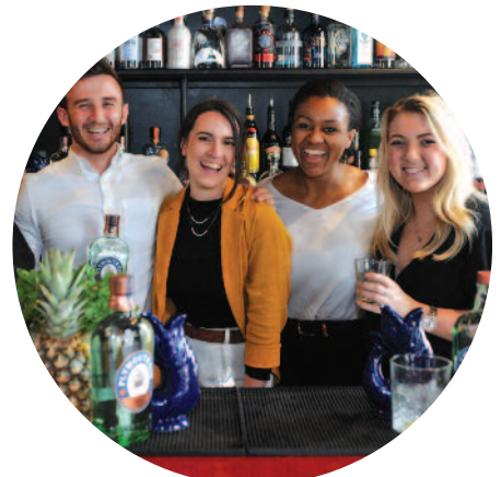
Enjoying a tippale at a Cocktail Week event at Lily Gins