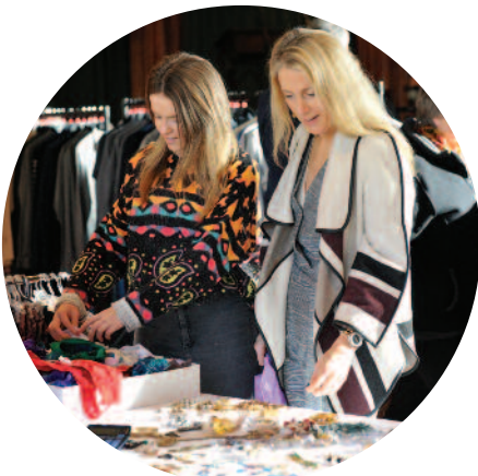
Hunting down a bargain at the Independents Sale

Events the BID launched in 2017 were also brought back bigger and better. The Independents Sale delighted businesses and customers alike at its new venue at Cheltenham Ladies’ College and the Chilli Fiesta and Cocktail Week were popular once again.